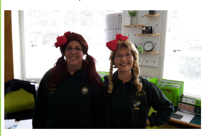
Have a happy holiday from the office crew!

LOST: Anyone knowing the whereabouts of these two James Cook staff members please let your local principal know. They are wanted for overworking and overstyling. Do not approach! They might burn your ears off.