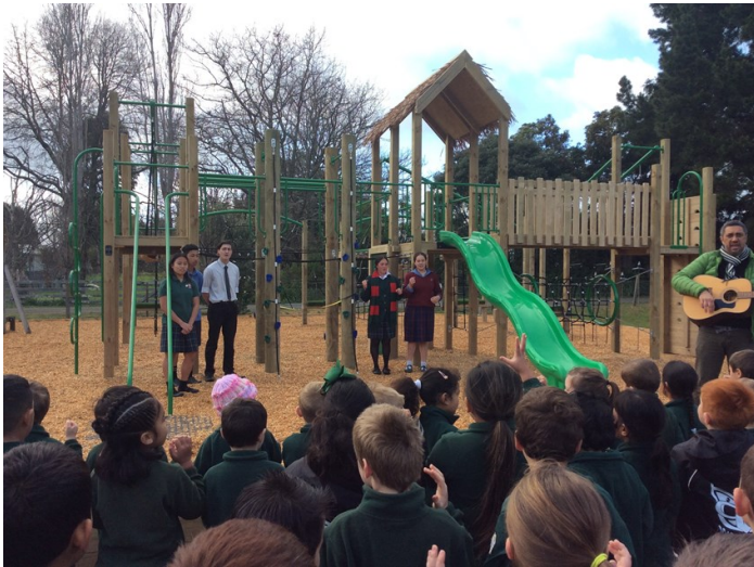
Playground Opening 2nd August 2019