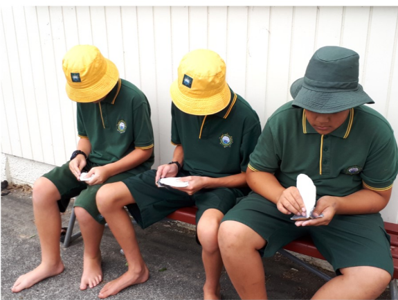
Students from Room 1 refining their artwork.