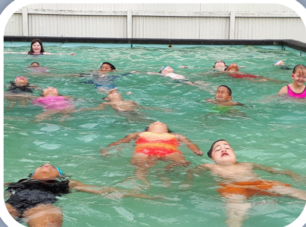
Room 3 enjoying floating to cool off.