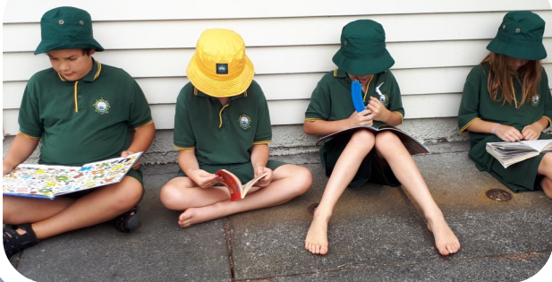
Students finding a shady spot to read.