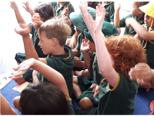
Rooms 4&9 learning a song together.